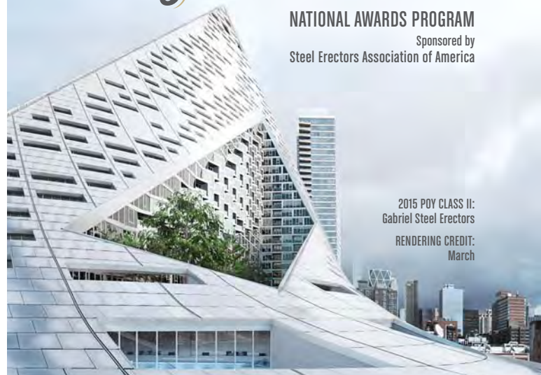
2015 POY CLASS II: Gabriel Steel Erectors

Sponsored by Steel Erectors Association of America