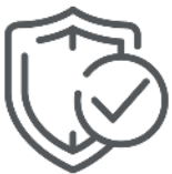
Avoid Security Breaches