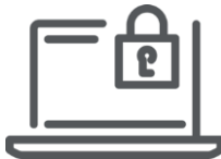
Financial Data Insurance