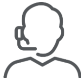
Supported by Experts