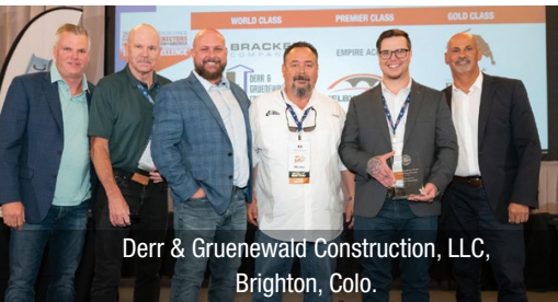
Derr & Gruenewald Construction, LLC, Brighton, Colo.