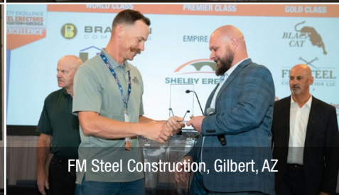
FM Steel Construction, Gilbert, AZ