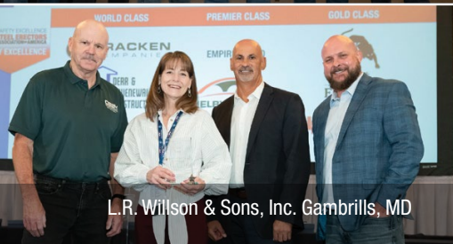
L.R. Willson & Sons, Inc. Gambrills, MD