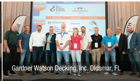
Gardner Watson Decking, Inc. Oldsmar, FL